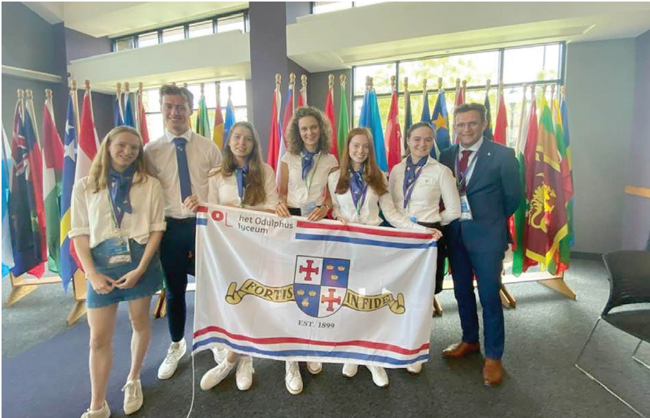
Above: Visitors to Buffalo-Niagara who participated at the International Student Science Fair. (Submitted photo)

District hosts ISSF; graduation approaches